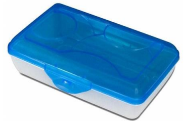
Example of a pencil box